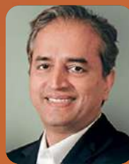
Dr. Devi Prasad Shetty Founder Chairman of Narayana Health