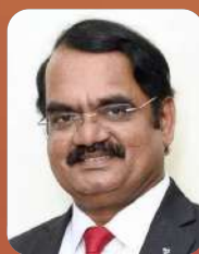
Dr. Mylswamy Annadurai The Moon Man of India, Former Director ISRO