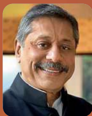
Dr. Naresh Trehan Founder Chairman of Medanta –The Medicity