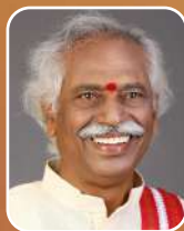
Shri Bandaru Dattatreya Hon'ble Governor of Haryana