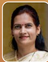
Dr. Bharati Pravin Pawar Union MoS for Health & Family Welfare and Tribal Affairs